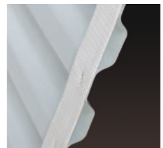
Corrugated Panel Design (Model 157C Shown)