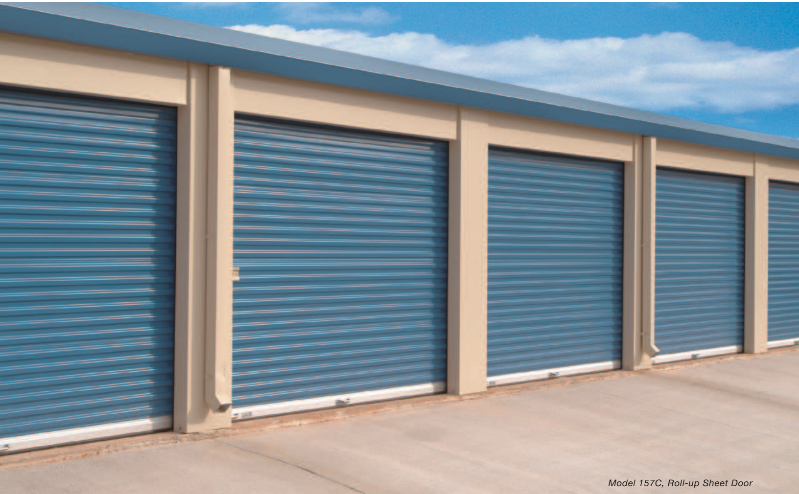
Model 157C, Roll-up Sheet Door